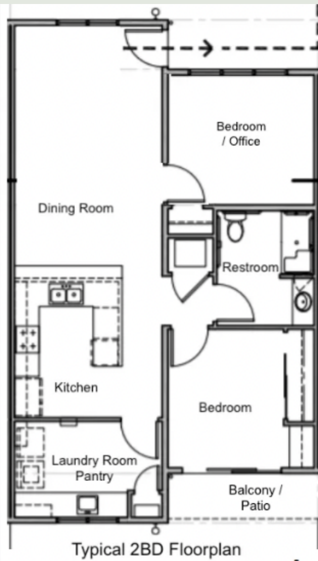
Typical 2BD Floorplan