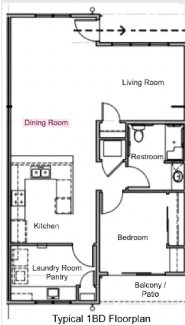
Typical 1BD Floorplan